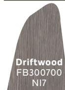
Driftwood FB300700 NI7