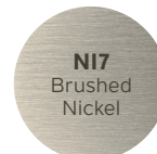
NI7 Brushed Nickel