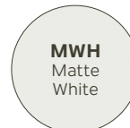
MWH Matte White