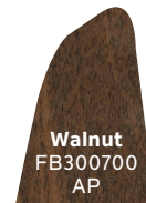
Walnut FB300700 AP

Blade Finish & Part Number (Side 1) Fan Finish (Reversible)