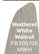
Weathered White Walnut FB300700 MWH