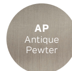
AP Antique Pewter