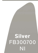
Silver FB300700 NI